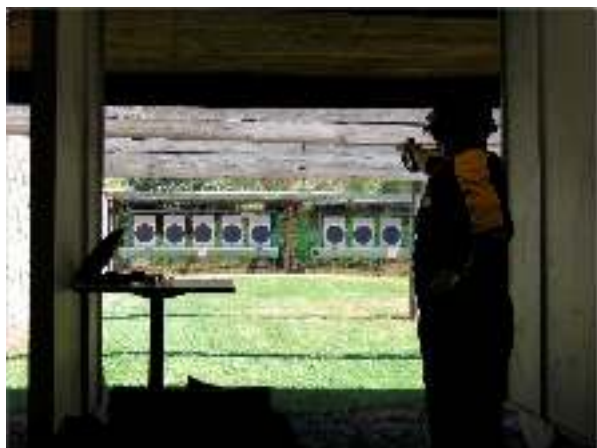
All Systems Go