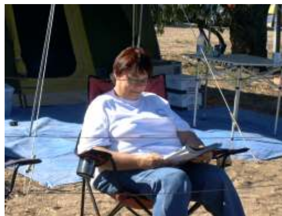
Still working hard –